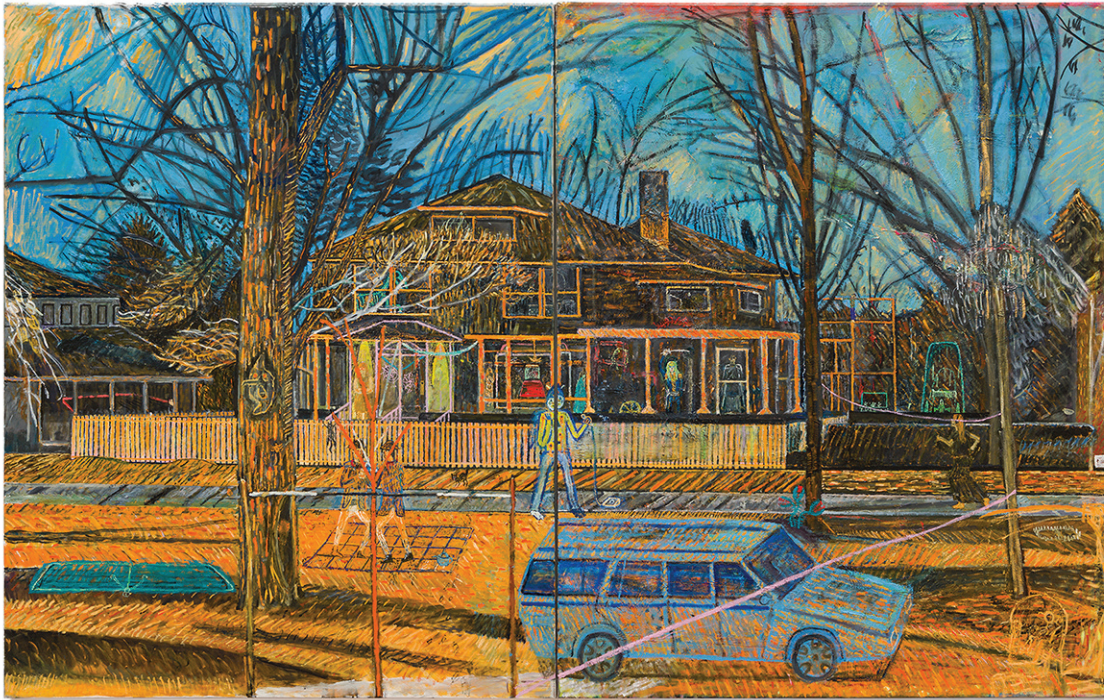
Lydia Farrell Double House 2025 Oil on canvas (diptych) 60 x 96 inches